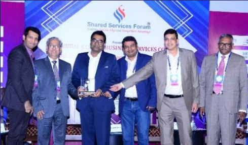
RAYMOND – LIFESTYLE BUSINESS – 2018