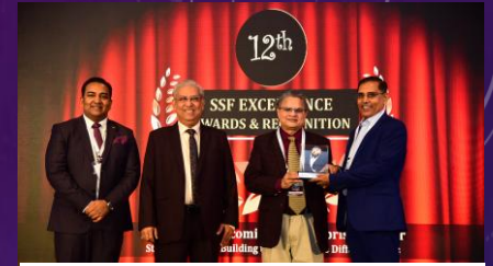
EY GLOBAL DELIVERY SERVICES – 2023