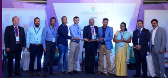
UNILEVER INDUSTRIES – 2019