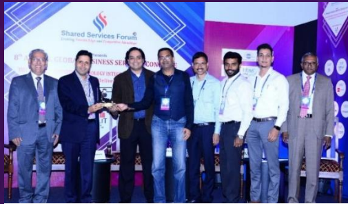
ANZ BENGALURU SERVICE CENTRE – 2018