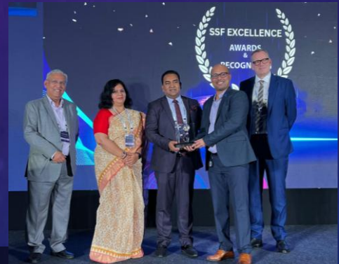
ALCON GLOBAL SERVICES "Delivering Business Impact Through Innovation & Excellence in Process"