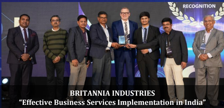
BRITANNIA INDUSTRIES "Effective Business Services Implementation in India"