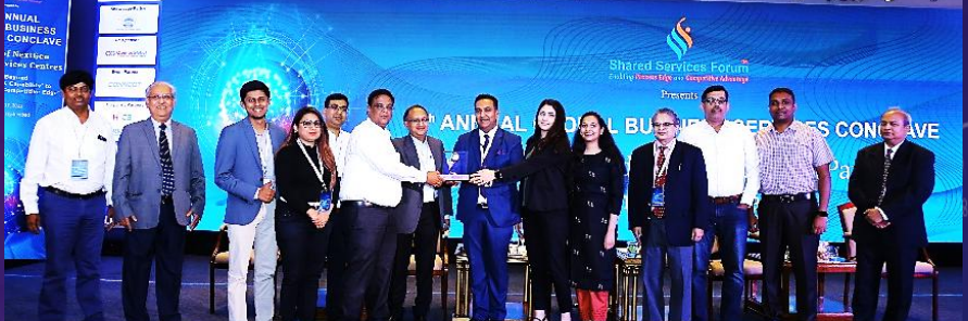
HINDUSTAN COCA-COLA BEVERAGES – 2022