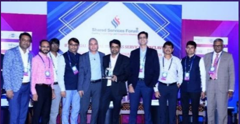
ADANI ENTERPRISES – 2018