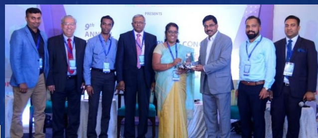
IBM INDIA – 2019