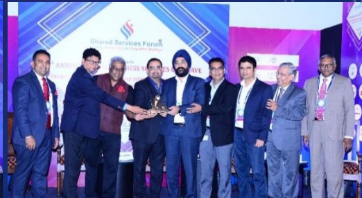
SYNGENTA SERVICES – 2018