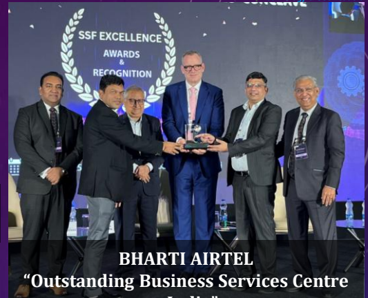
BHARTI AIRTEL "Outstanding Business Services Centre - India"