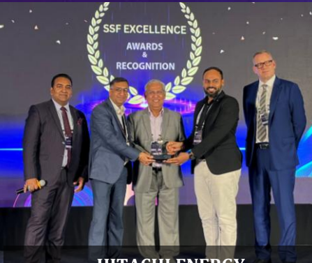
HITACHI ENERGY "Delivering Business Impact Through Effective Digital Transformation - International"