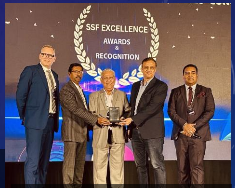
WARNER BROS. DISCOVERY "Successful Launch of Business Services Centre in India"