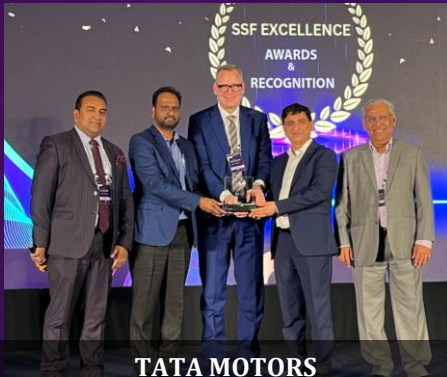
TATA MOTORS "Delivering Business Impact Through Effective Digital Transformation - India"