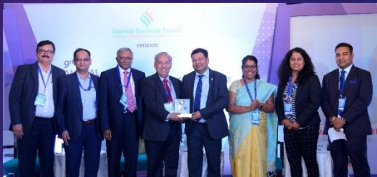
JSW GLOBAL BUSINESS SOLUTIONS – 2019