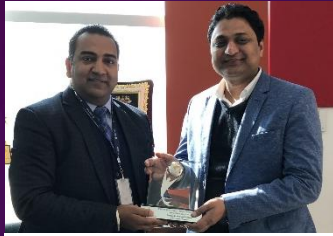
ERICSSON INDIA GLOBAL SERVICES – 2018