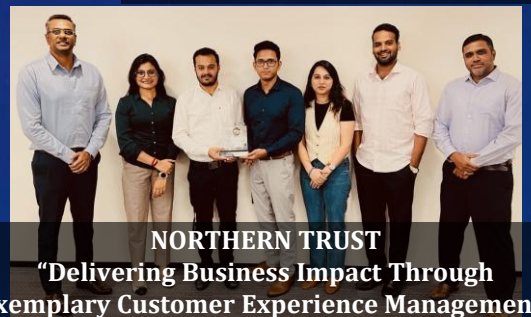
NORTHERN TRUST "Delivering Business Impact Through Exemplary Customer Experience Management"