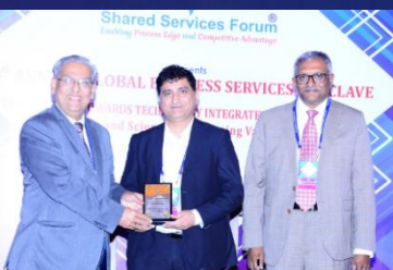
AKZONOBEL GLOBAL BUSINESS SERVICES – 2018