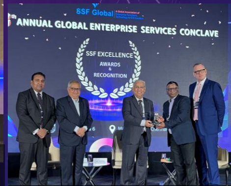
SMITH+NEPHEW "Outstanding Business Services Centre - International"