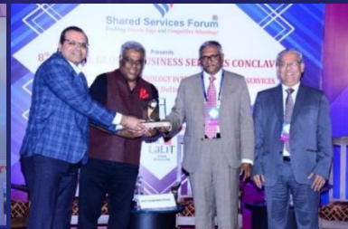
PIRAMAL ENTERPRISES – 2018