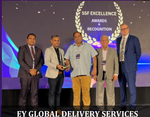
EY GLOBAL DELIVERY SERVICES "Delivering Business Impact Through Innovative People Practices"