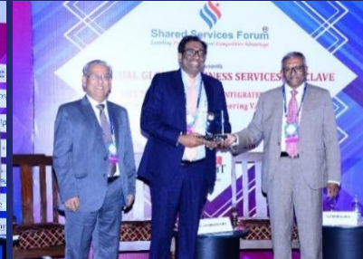
COMPASS GROUP UK & I – 2018