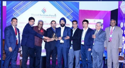
SYNGENTA SERVICES – 2018