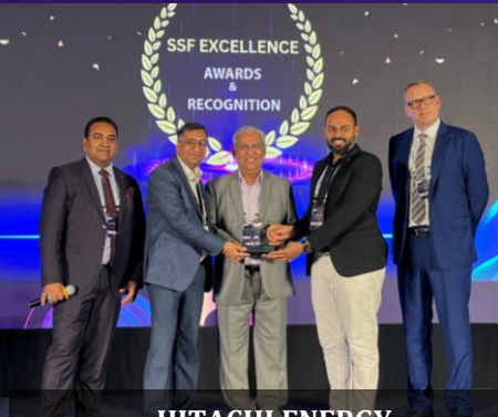
HITACHI ENERGY "Delivering Business Impact Through Effective Digital Transformation - International"