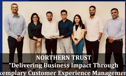
NORTHERN TRUST "Delivering Business Impact Through Exemplary Customer Experience Management"