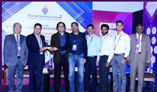
ANZ BENGALURU SERVICE CENTRE – 2018