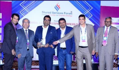
RAYMOND – LIFESTYLE BUSINESS – 2018