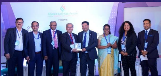
JSW GLOBAL BUSINESS SOLUTIONS – 2019