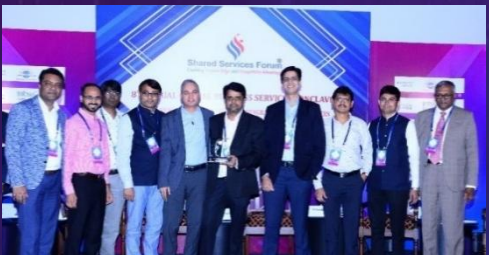
ADANI ENTERPRISES – 2018