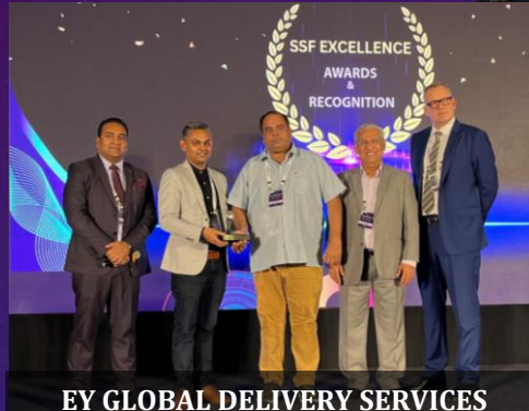
EY GLOBAL DELIVERY SERVICES "Delivering Business Impact Through Innovative People Practices"