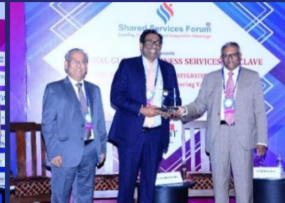
COMPASS GROUP UK & I – 2018