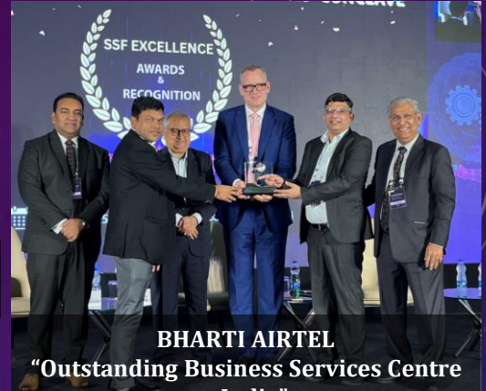
BHARTI AIRTEL "Outstanding Business Services Centre - India"