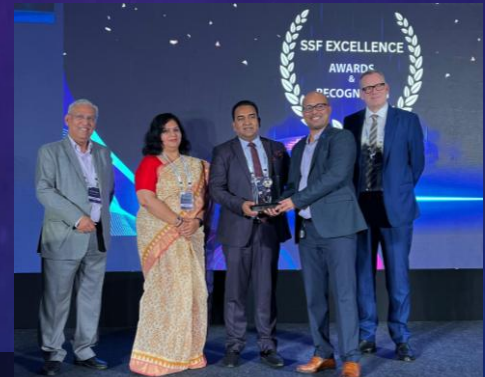
ALCON GLOBAL SERVICES "Delivering Business Impact Through Innovation & Excellence in Process"