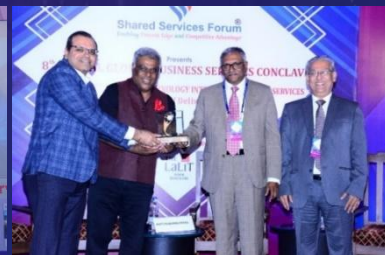
PIRAMAL ENTERPRISES – 2018