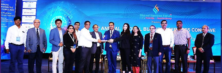
HINDUSTAN COCA-COLA BEVERAGES – 2022